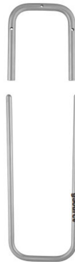
Weinstein Instrument Holder 2 3/4" wide U-shaped, closed end